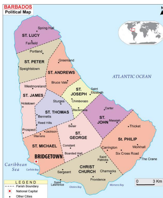
Figure 1: BSLC strata (Barbados parishes)

The BSLC 2016 is based on a stratified two-stage area probability sample which spreads over 12 consecutive months and includes 2,508 households distributed across 11 strata corresponding to the 11 parishes.